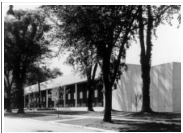
Figure 7. Kettering Hall soon after it opened in 1961. The quartz aggregate section in the foreground housed the Science Library and the main lecture halls; the chemistry half of the building is immediately to the left.