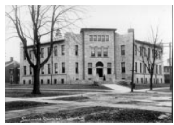
Figure 3. Severance Chemical Laboratory, completed in 1901.