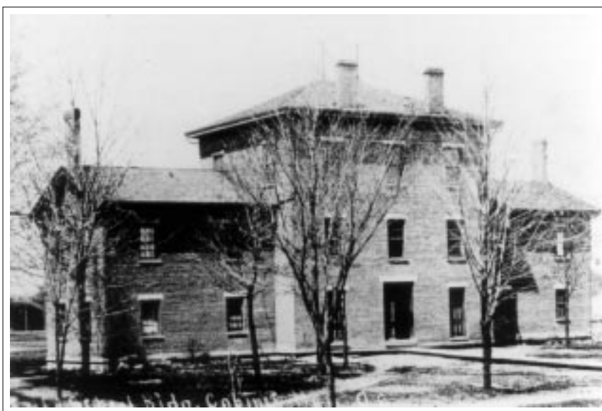
Figure 2. Cabinet Hall in the early 1880s when it housed the departments of chemistry and biological sciences.

At first the only chemistry course that Jewett taught was a general inorganic course for juniors. He also taught mineralogy and some other courses such as rhetoric. Qualitative and quantitative analysis and a course in organic chemistry were soon added, all taught by Jewett. Laboratory work for the students remained optional until 1895, when Jewett finally had an assistant to help with the laboratories. When the north wing of the laboratory building was sacrificed to build a new college building in 1886, Jewett inherited the whole of the remaining structure (1).